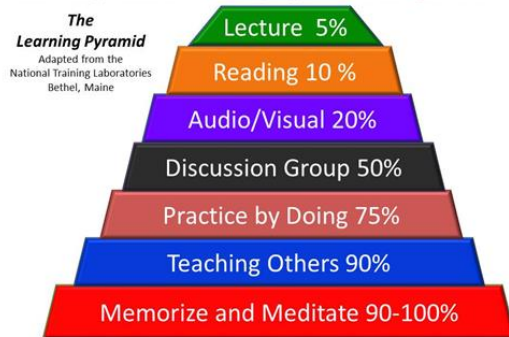
The Average Retention Rate of Different Teaching Methods

Getting to 90% or "A" level on the "Learning Pyramid" means you will need to master this material