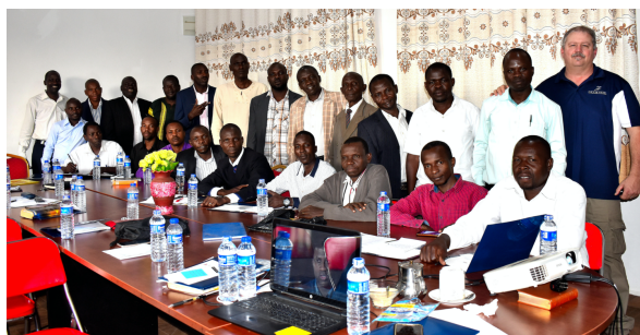
EMAW Leaders of Mbale