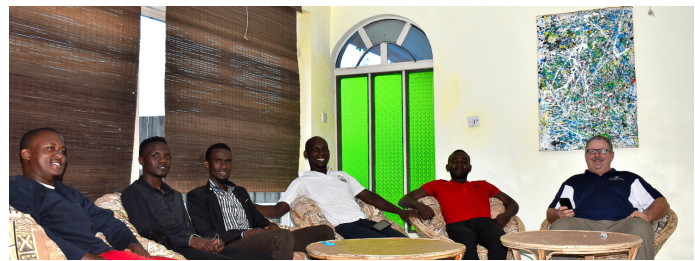
2nd Group on Sunday Eve – all close friends